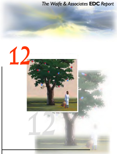
The Waife & Associates EDC Report