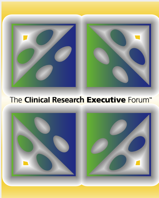
The Clinical Research Executive Forum™

■ For more than a decade, we have run the most outstanding series of Executive Retreats on Clinical Operations, and Technology in Development. Visit www.waife.com/forum.html . Rest, learn, network, challenge, and revive with your peers.