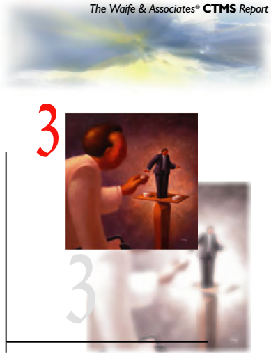
The Waife & Associates® CTMS Report