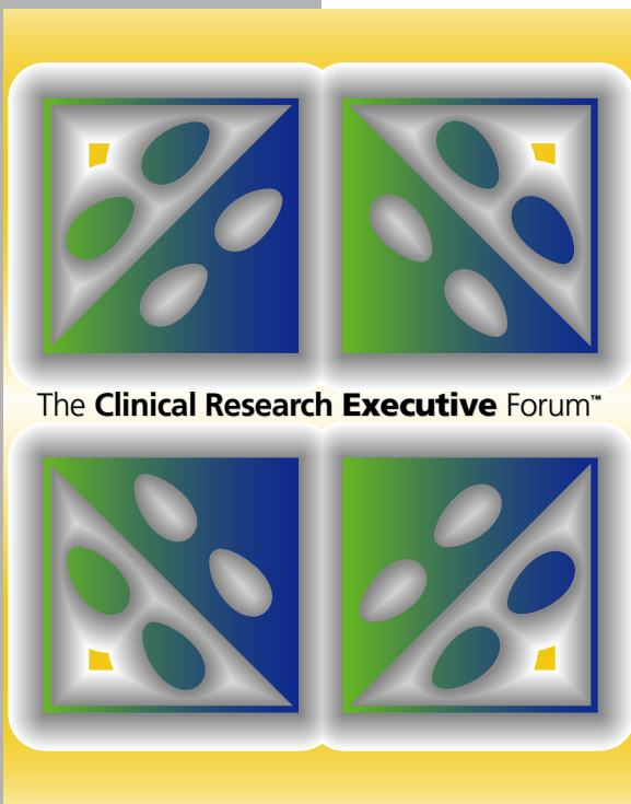
The Clinical Research Executive Forum™

Come to the beautiful peace of Amelia Island in May; return with real learnings and new colleagues.